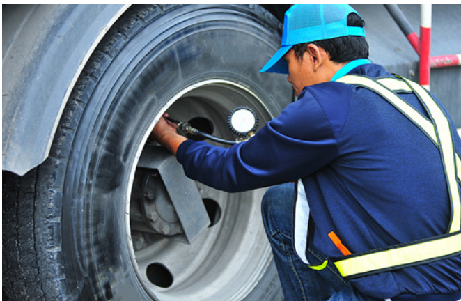
/// Automotive applications

Delivering superior performance over piston compressors makes New Silver an ideal solution for automotive and industrial applications requiring continuous demand of compressed air, where operating conditions are often challenging and pressure reliability is crucial.