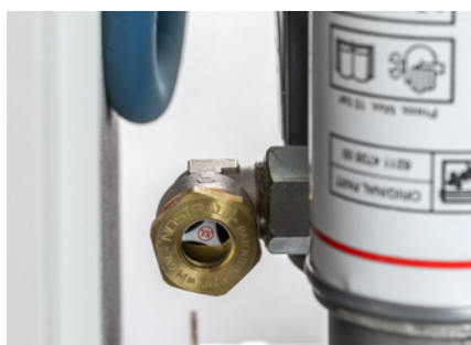
/// Oil level check