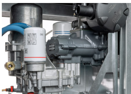
/// Oil filtration