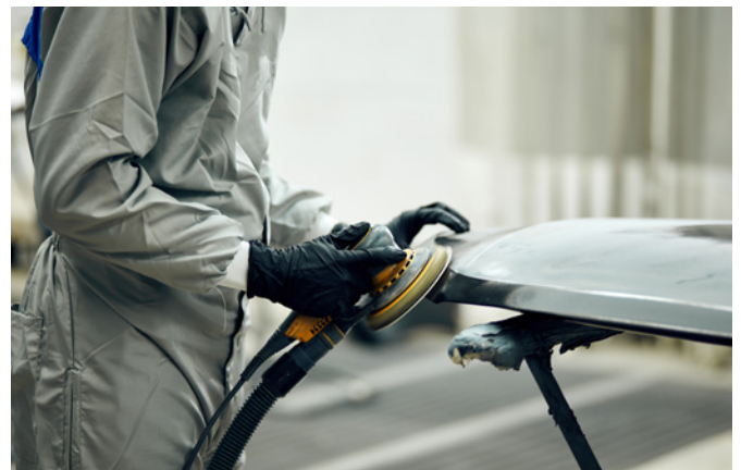
/// Industrial applications