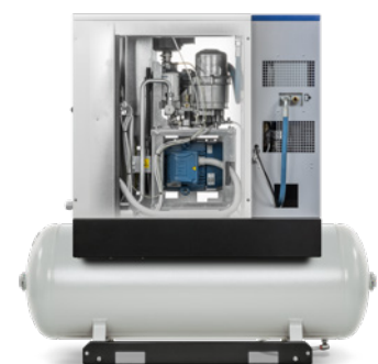
/// Easy maintenance